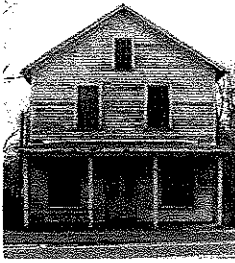
166 South Main St.

Have you noticed the white wooden barn-like building at 166 South Main? You may have noted that it is looking shabby, or that it is for sale along with the white house next door. But this white building with its double doors and large display windows has had an interesting past.